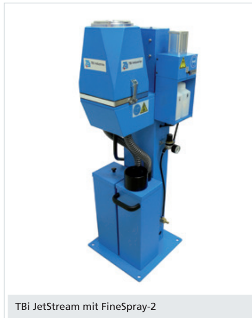
TBi JetStream mit FineSpray-2

The anti-spatter fluid can only guarantee an effective protection after an optimal cleaning of the torch. For that reason, we recommend to use the TBi FineSpray-2 as supplement to the automatic torch cleaning unit TBi JetStream. Also for existing systems with conventional reamer cleaning, you can benefit by retrofitting the TBi FineSpray-2 unit into the welding cell.